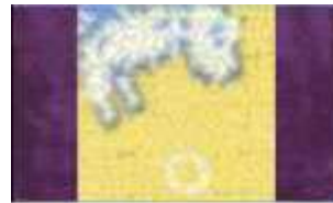
Sashing square B