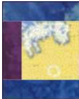
Sashing square A bottom row