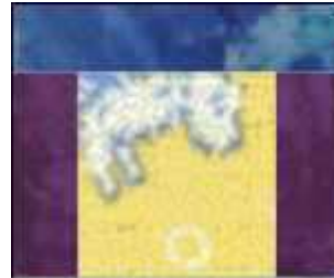
Sashing square B