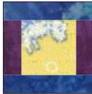
Sashing square B bottom row